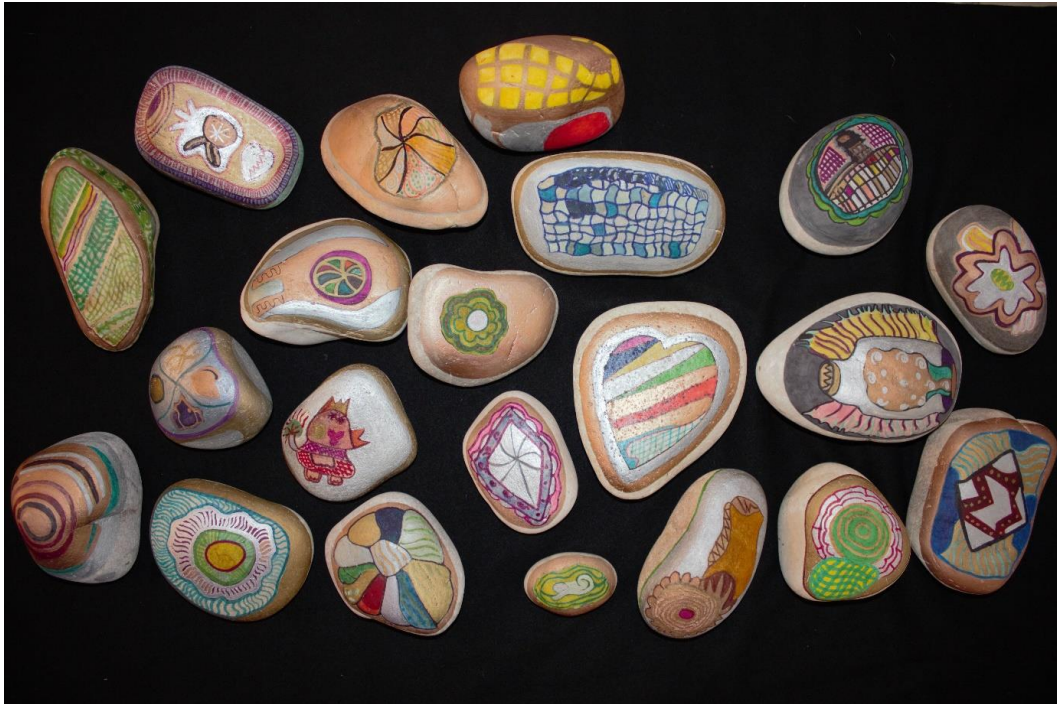
Richard Hunt, Rocking the Boat on the Beach , Video installation, 2018