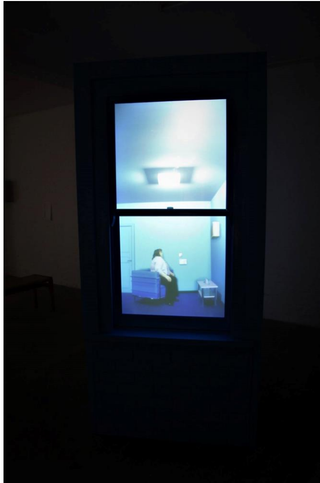
Lucy Skuce, Blue Sash Window , Video installation, 2018