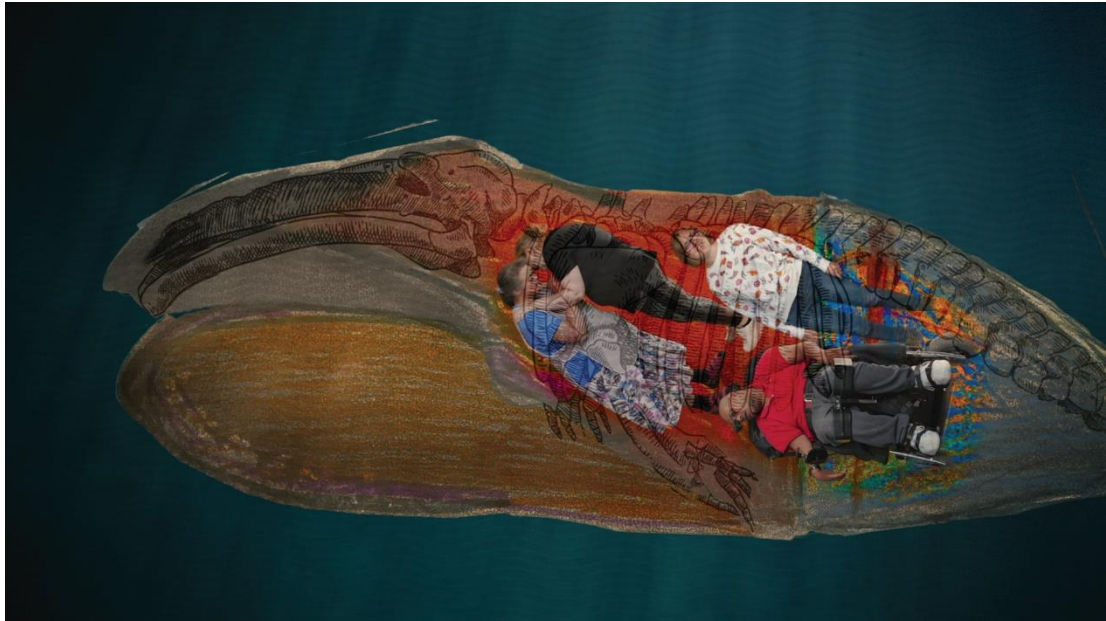
Shadowlights Associates, still from Undersea Adventure , HD Video, 2018